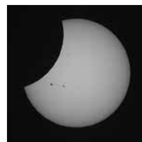
Partial Solar Eclipse