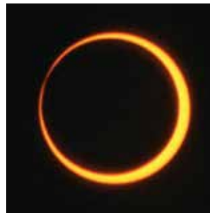
Annular Solar Eclipse