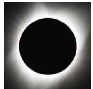
Total Solar Eclipse